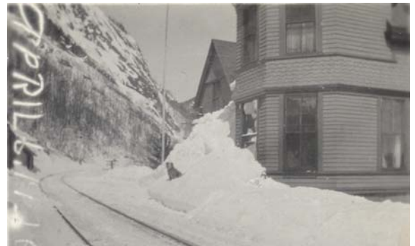
Above: Mt. Willard Section House, in 1916.