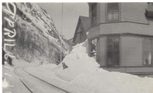
Above: Mt. Willard Section House, in 1916.